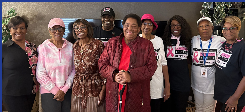
Volunteers with B&A Entertainment Services, a southern Nevada nonprofit that provides peer mentoring and education to increase breast cancer screening in the Black community.

NCC updated its popular screening guidelines cards to be gender neutral, developed outreach materials tailored for the LGBTQ+ community, shared continuing education programs, and looked for opportunities to use inclusive imagery. Team members participated in Pride night at the Reno Aces, the Northern Nevada Pride Parade and Festival, and Las Vegas Pride—and had a fantastic time!