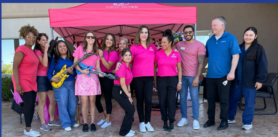
NCC worked with partners from Dignity Health, Pueblo Medical Imaging, Genentech and Anthem Blue Cross Blue Shield for a mammogram party and served 19 Nevadans who were behind on breast cancer screening.